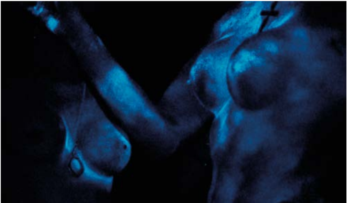
Lucciole , 2021 Film, 7 min. 19 Courtesy of the artist, Feel Good Cooperative, Ellen de Bruijne Projects, ChertLüdde Production Jacqui Davies, PRIMITIVE Film Coproductio HKW Berlin and Crac Occitanie

With the cooperative, Pauline Curnier Jardin created a film entitled Lucciole (Fireflies). It presents this same group of women in the night, in a twinkling of shadows and lights along roadsides, in the fields on the edge of Rome where they usually work. In a 1975 article, filmmaker and author Pier Paolo Pasolini deplored the “disappearance of the fireflies”, as part of an ecological disaster that he examined in light of all-powerful capitalism, which turns everything into an object of consumption. Furthermore, in Italian familiar language, “lucciole” also refers to sex workers. It is through this dual imagination, of social marginality and of crises both ecological and economic, that Pauline Curnier Jardin, with the Feel Good Cooperative, reexamines the symbolism of the firefly, while re-injecting a potential for life, collective joy and magic at the edge of night.