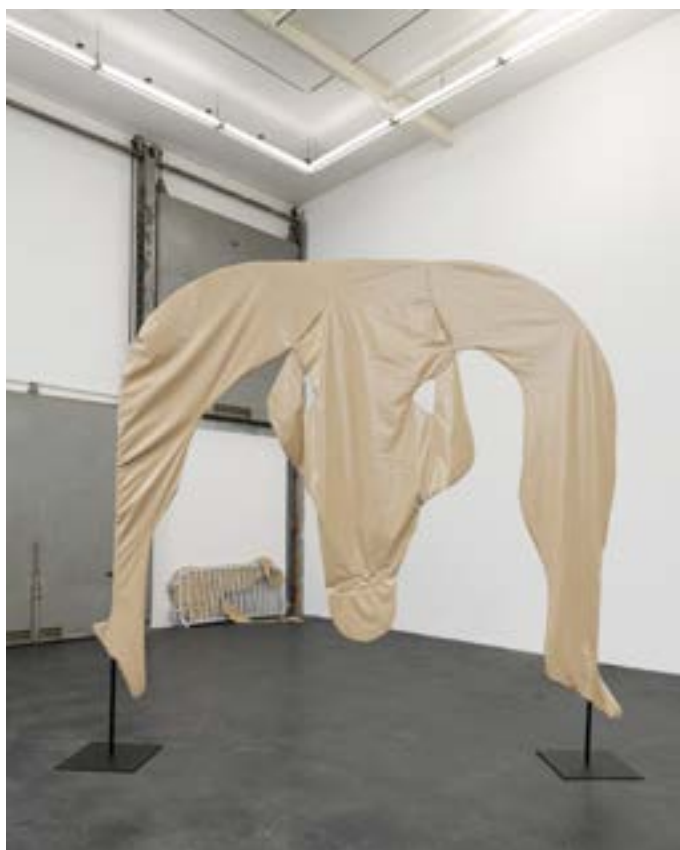
(Forefront) La géante-dame , 2022 Synthetic fabric, metal Courtesy of the artist, Ellen de Bruijne Projects, ChertLüdde Production Crac Occitanie

In this film as in the other installations shown at the Crac Occitanie, Pauline Curnier Jardin reconnects sacred and secular, body and spirit, individual and collective, male and female... all territories that she reconstructs through hybrid, transgressive forms, in which the centres never cease being re-penetrated by their own margins.