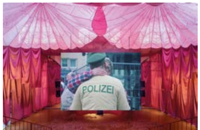
View of the exhibition Fat to Ashes , Hamburger Bahnhof - Museum für Gegenwart - Berlin, 2021 Arena-Installation Fat to Ashes HD video (transferred from 16 mm and Super 8 film), colour, 20 min. 55 Production Jacqui Davies / PRIMITIVE FILM