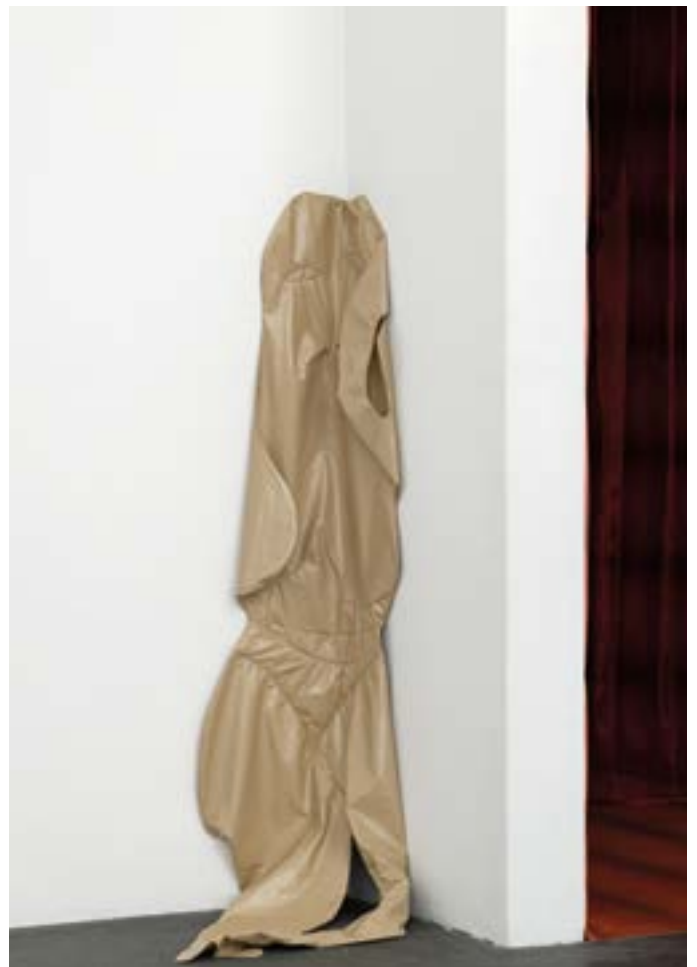
Peaux de Dame , 2018-2022 Synthetic fabric Courtesy of the artist, Ellen de Bruijne Projects, ChertLüdde