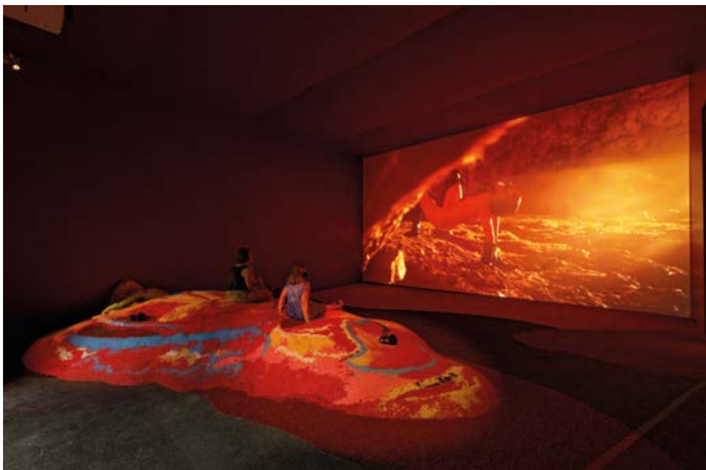
Grotta Profunda Approfundita , 2011-2017 Film, 25 min. Mixed media installation, dimensions variable Courtesy of the artist, Ellen de Bruijne Projects, ChertLüdde