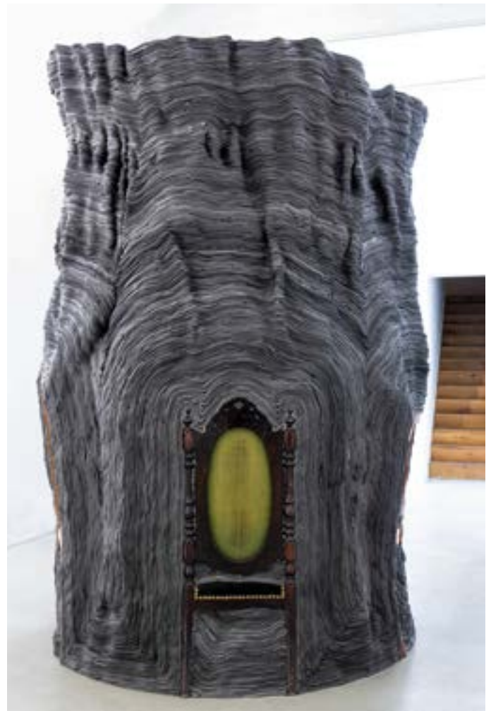
Hugo Bel Paysage mental 2022 Plaster, black pigment, chairs, 270 x 160 x 160 cm, 2022