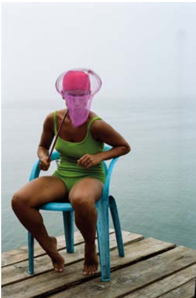
De l'impertinence

The title of this summer program refers to the city of Sète's main canal, which runs alongside the Crac Occitanie.