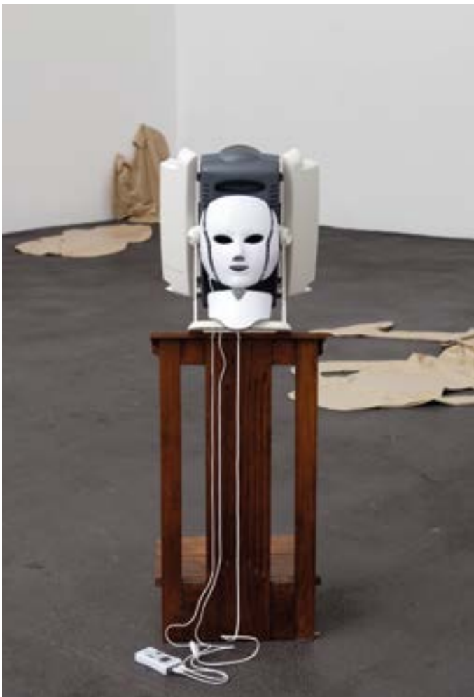
I'm not bad, I'm just drawn that way , 2022 Mask, altarpiece, prie-dieu Courtesy of the artist, Ellen de Bruijne Projects, ChertLüdde Production Crac Occitanie.

This close encounter of the third kind between the worlds of beauty salons and churches establishes a dialogue between physical and spiritual cultures, attracting both sacred and secular light, celestial and terrestrial worlds. It is also a way of recalling the contradictory injunctions to which the female body is subject: exhibition in broad daylight or chaste covering-up.