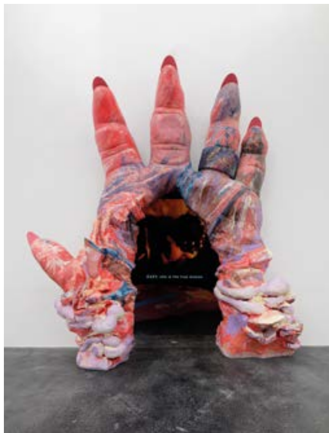
Grotta Profunda Approfundita, 2011-2017 Film, 25 min. Mixed media installation, dimensions variable