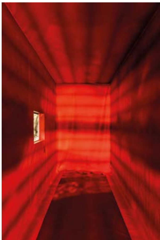
Blonde Sas (Blond Corridor), 2022 Recycled theatre scenery, LEDs, curtains made of PVC strips Courtesy of the artist, Ellen de Bruijne Projects, ChertLüdde Production Crac Occitanie

Pauline Curnier Jardin established a series of workshops with these women, and for the price of a trick, she commissioned drawings from them, in which they depict work scenes. All proceeds from the sale of works are shared among all members of the cooperative, with a view to providing social assistance during the pandemic. The drawings have been shown in several exhibitions since 2020, and are being presented at the Crac in a new setup produced for the occasion : Le tombeau . Visitors are invited to put a token into a machine that activates the lighting in a room that looks like a diorama, which could refer to the Lascaux caves or the Etruscan tombs, or to the chapels and crypts of Christian churches. On the walls of a space that oscillates between a miniature temple and the tent of an archaeological dig, the cooperative's different drawings are reproduced.